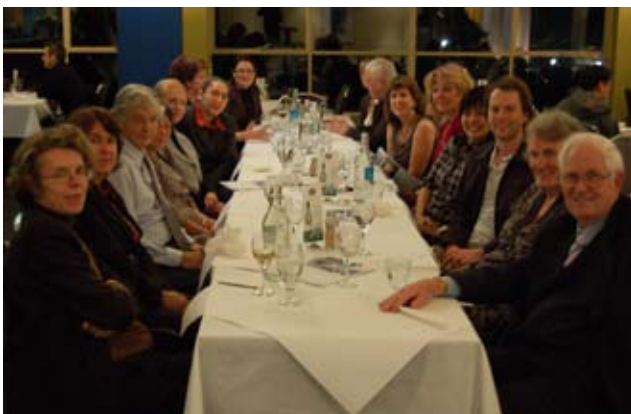
Twenty guests attended the June alumni dinner.

We look forward to seeing everyone there!